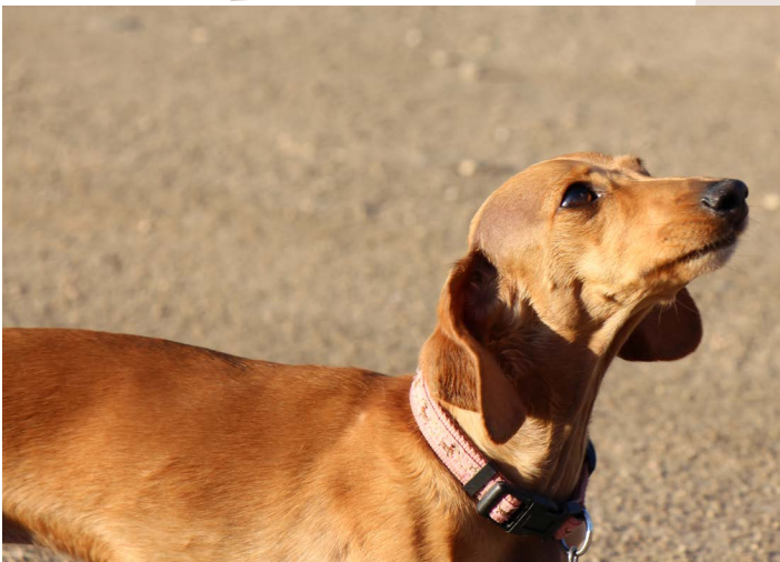
Our dachshund, Ella