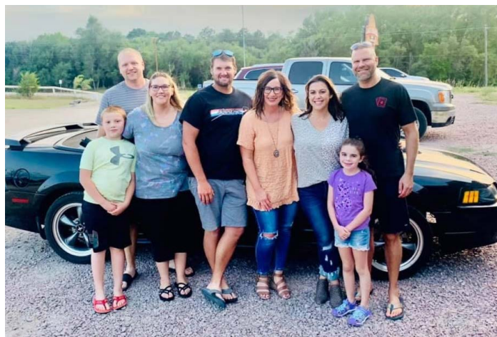
Evening out with friends