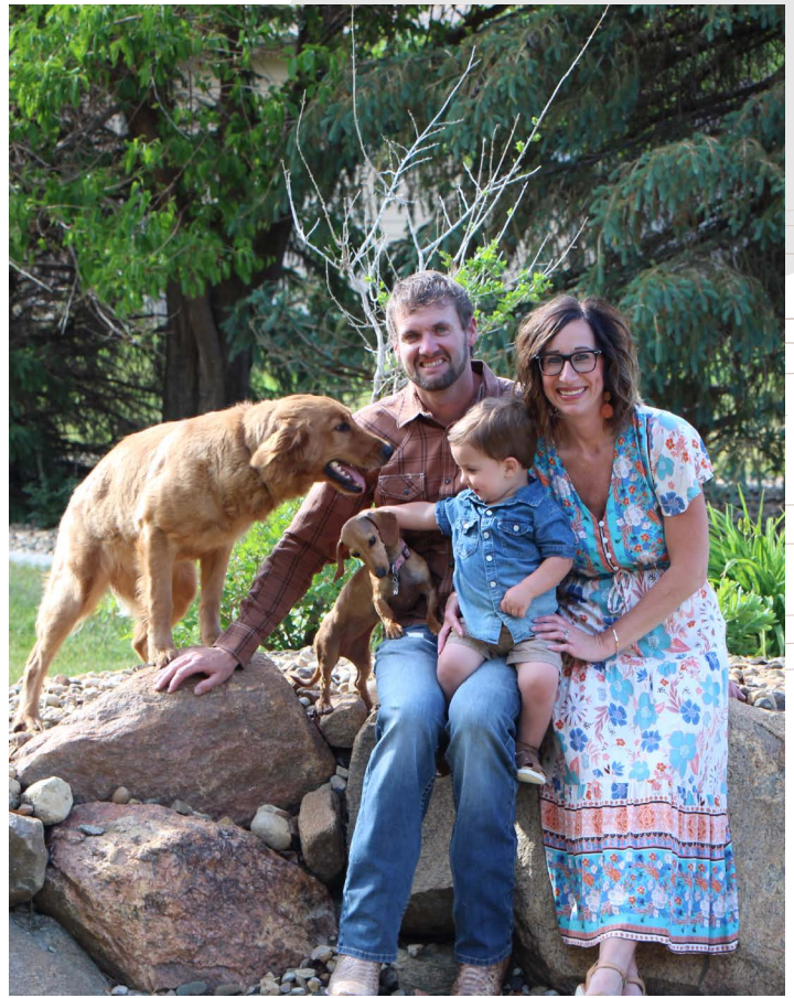
Our puppies bring us so much joy