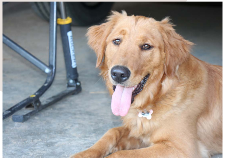
Our golden retriever, Ivy