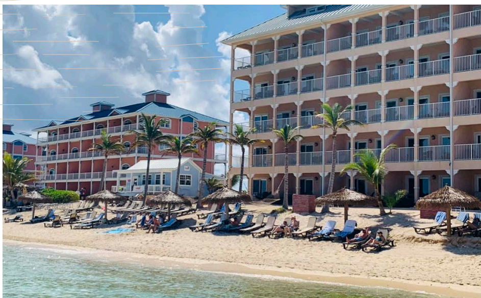
Our happy place: Grand Cayman